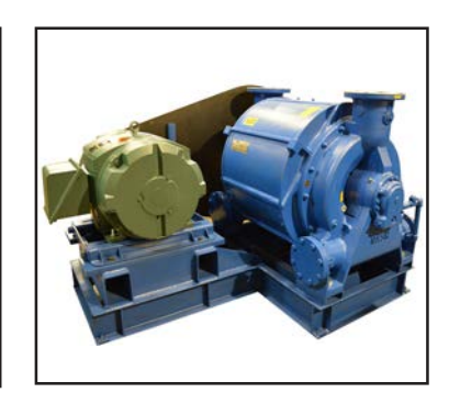
Vaccuum Frame w/Motor Adjustments