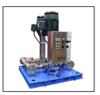
Duplex Booster Package w/Controls