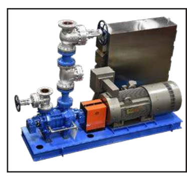
High Pressure Multi Stage Control Package