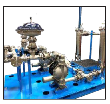
Stainless Steel- Air Operated Filtration Pumping System