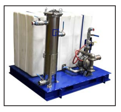
AOD Filter Tank System