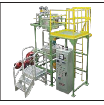
Custom Designed Water-Weigh Dosing Platform