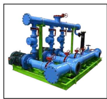
TriPlex Filtration Skid