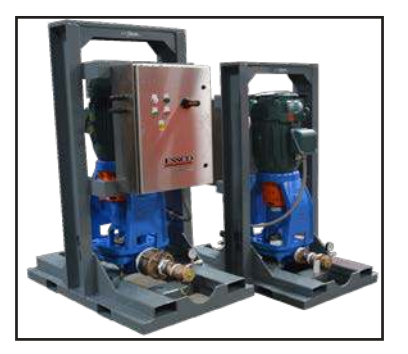
Custom 3996 Hanging Bases