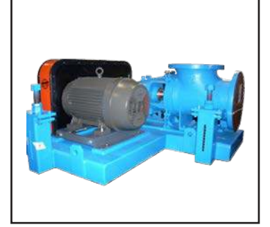
Custom Axial Flow Bases w/ Motor Adjusters