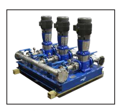
SS TriPlex Booster System