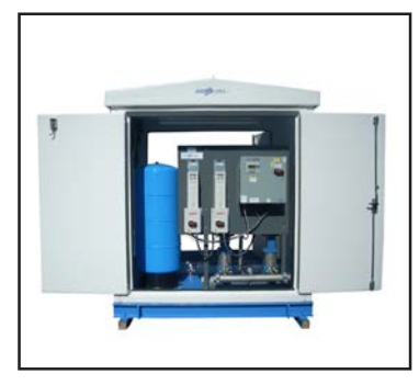
Enclosed Booster Pump System w/ Control Panel