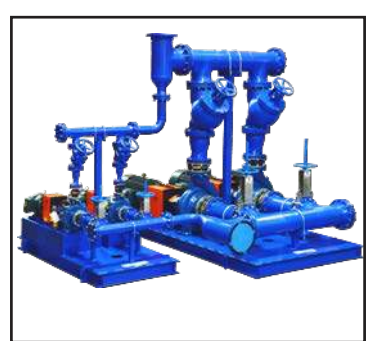
Tandem Package Skids