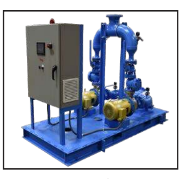
Apex Duplex w/Controls