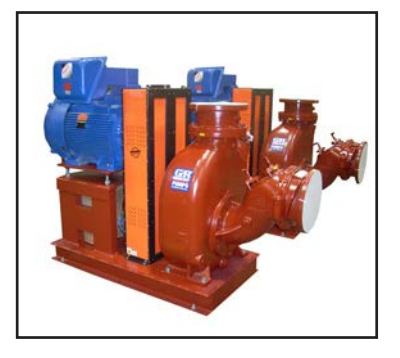
Self-Priming Fire Pump w/Bases