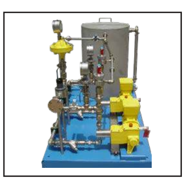
Metering Pump Skid