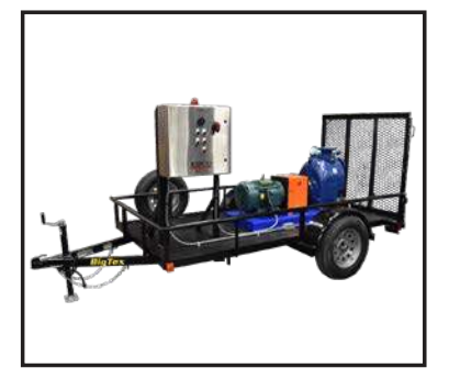
Trailer Mounted Self-Priming w/ Control Panel