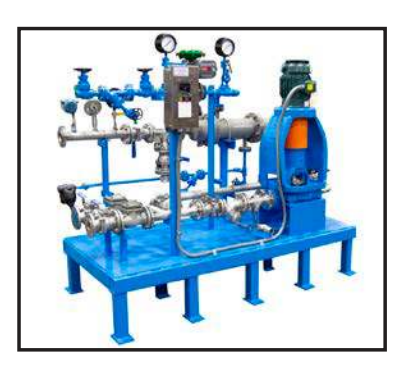
Self Regulating In-Line Heat Exchanger