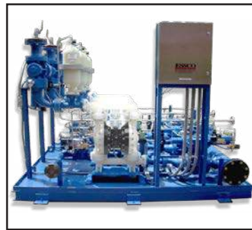
AODD Multi Pump Package