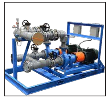
Duplex System with Plastic Piping w/ Controls