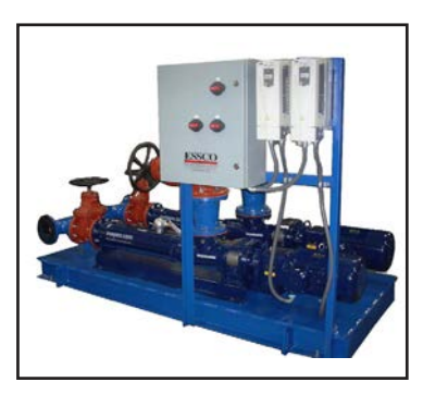
Controlled Progressive Cavity Pumping System